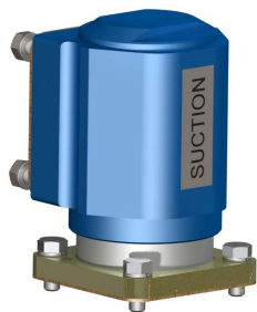
RIS-FLANGE2-SUCTION-MK2-LT 2" non shut-off suction module without suction tube.