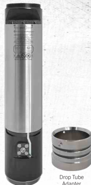
Drop Tube Adapter

The Defender Series® Overfill Prevention Valve (OPV) prevents the overfill of an underground storage tank during a gravity-fed product delivery. It employs a revolutionary magnetically-coupled actuator system to provide positive shutoff. This unique method of shutoff eliminates any penetrations in the valve, making it both vapor and leak tight. This also allows for remote compliance testing of the primary functionality at grade level without having to remove the OPV from the tank.