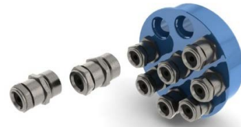
RIS-DONUT-9-20 shown above with optional cable glands

Pt No. RIS-DONUT-5-20 Body diameter 99mm 5 x M20 ports (without glands)