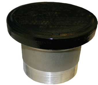
6" vent (244OM)

WARNING: DO NOT FILL OR UNLOAD FUEL FROM A STORAGE TANK UNLESS IT IS CERTAIN THAT THE TANK VENTS WILL OPERATE PROPERLY. Morrison tank vents are designed only for use on shop fabricated atmospheric tanks which have been built and tested in accordance with UL 142, NFPA 30 & 30A, and API 650 and in accordance with all applicable local, state, and federal laws. In normal operation, dust and debris can accumulate in vent openings and block air passages. Certain atmospheric conditions such as a sudden drop in temperature, below freezing temperatures, and freezing rain can cause moisture to enter the vent and freeze which can restrict internal movement of vent mechanisms and block air passages. All storage tank vent air passages must be completely free of restriction and all vent mechanisms must have free movement in order to insure proper operation. Any restriction of airflow can cause excessive pressure or vacuum to build up in the storage tank, which can result in structural damage to the tank, fuel spillage, property damage, fire, injury, and death. Monthly inspection, and immediate inspection during freezing conditions, by someone familiar with the proper operation of storage tank vents, is required to insure venting devices are functioning properly before filling or unloading a tank.