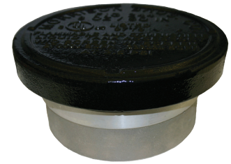
6" vent (244O)

† Indicates model is available in a kit.